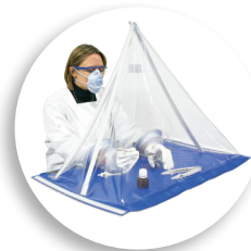
For laboratory investigations on a bench