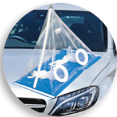
On a car