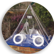
On a wall