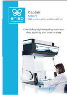
Captair Smart Weighing Stations