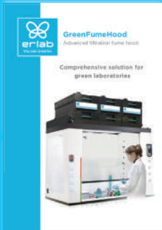
GreenFumehoods an alternative to ducted fume hoods