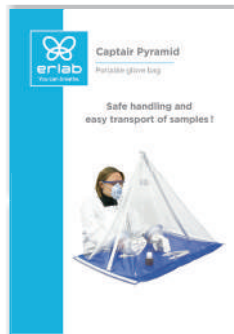
Captair Pyramid Portable Glovebox