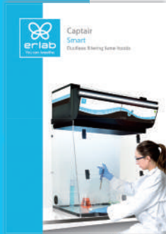
Smart Fume Hoods for your routine handlings