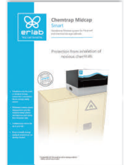
Chemtrap Midcap Filtration System