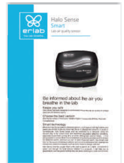
Halo Sense Lab Air Quality Sensor