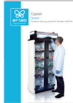
Captair Smart Storage cabinets