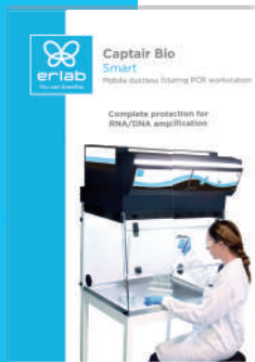
Captair Bio PCR Workstations