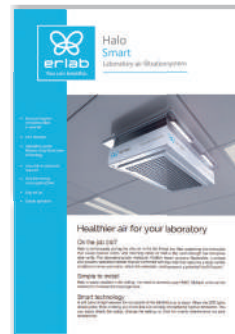
Halo Laboratory Air Filtration system