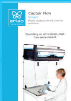
Captair Flow Clean Air Enclosures